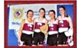
Freshman Quad - #1 at Mid Atlantic