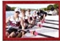
V Quad - Medalists at City Championships