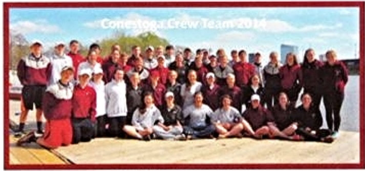
Spring Kickoff - Bachelors Barge, Boathouse Row