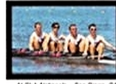
At Club Nationals - San Diego, CA