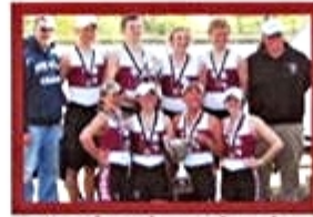
Varsity Quads - Sweep the Cooper Cup